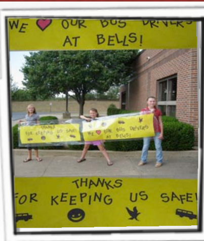
BELLS CITY ELEMENTARY GREETED BUS DRIVERS WITH A THANK YOU SIGN

If you did not participate in this appreciation day, it's not too late to get involved. Please click here to see a list of all of the appreciation days for 2010-2011.