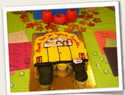
CAKE FOR BUS DRIVERS- PATHWAYS ALTERNATIVE SCHOOL