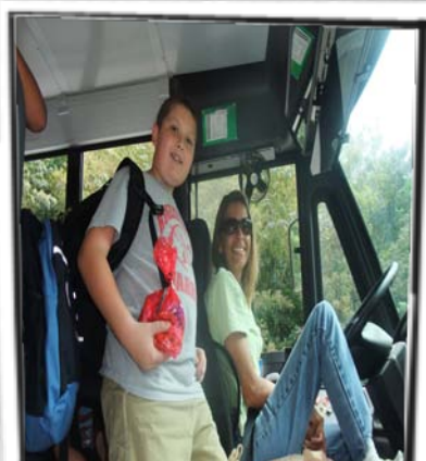
ROGERSVILLE CITY PASSED OUT BAGS FULL OF TREATS TO BUS DRIVERS ON APPRECIATION DAY