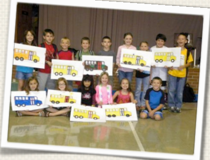
CARTER'S VALLEY ELEMENTARY STUDENTS HOLD UP THEIR PICTURES