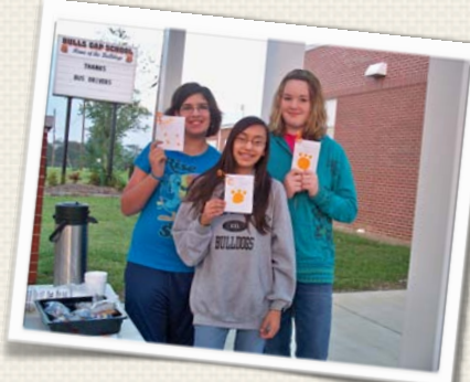
STUDENTS AT BULLS GAP SCHOOL HOLDING THANK YOU NOTES