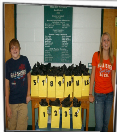
HOUSTON COUNTY MIDDLE SCHOOL MADE GOODIE BAGS FOR BUS DRIVERS