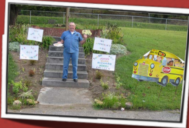
Keplar Elementary gave their bus drivers thank you booklets, bus shaped cookies and posters made by the students.

"By appreciation, we make excellence in others our own property." -Voltaire