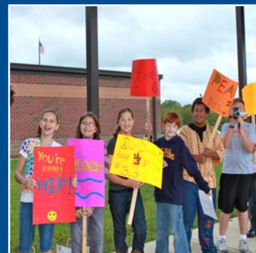
A-Team members holding Bus Driver Appreciation Signs

Involvement in the A Team gives each member an increased self-worth and self-esteem. Adult leaders serve as advisers while A Team members implement the activities thus providing more people with the opportunity to join in this rewarding experience. The A-Team benefits the students, the adult leaders and the school. It is a win-win for everyone.