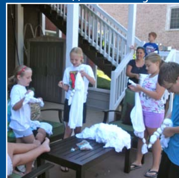
A-Team members tie-dyeing t-shirts for bus drivers