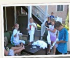
A-Team Members making Tie-Dye shirts for the bus drivers.

Each A-Team presented a copy of the newsletter to school bus drivers--the group being honored-- to increase the recognition and honor even more.