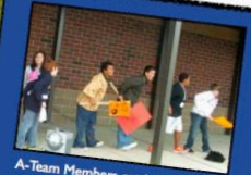
A-Team Members getting into the groove for Bus Driver Appreciation Day.