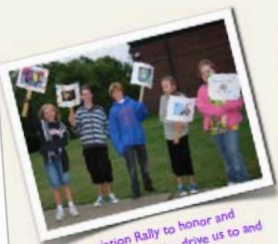
Appreciation Rally to honor and recognize those who drive us to and from school each day safely.