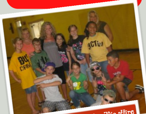
A-Team Members dressed in 70's attire for the appreciation day

W. A. Wright Elementary for notes and chalk pictures on the sidewalk drawn by the students.