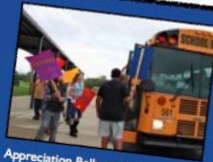
Appreciation Rally to honor and recognize those who drive us to and from school each day safely.

The goal was to show how much students care about their bus drivers. Getting there early was a little hard but it was worth it! The bus drivers thanked all of us.