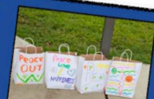
Boogie Bags decorated in a 70's theme by A-Team members filled with goodies for all of the bus drivers.