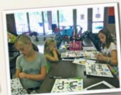
Totally Hip Signs being made to honor the bus drivers.